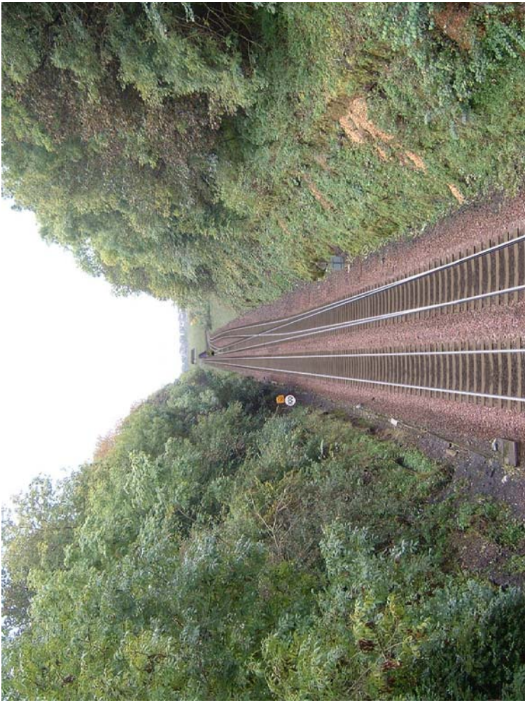
Proposed view eastwards from pedestrian bridge (to the west of the junction) along rail line