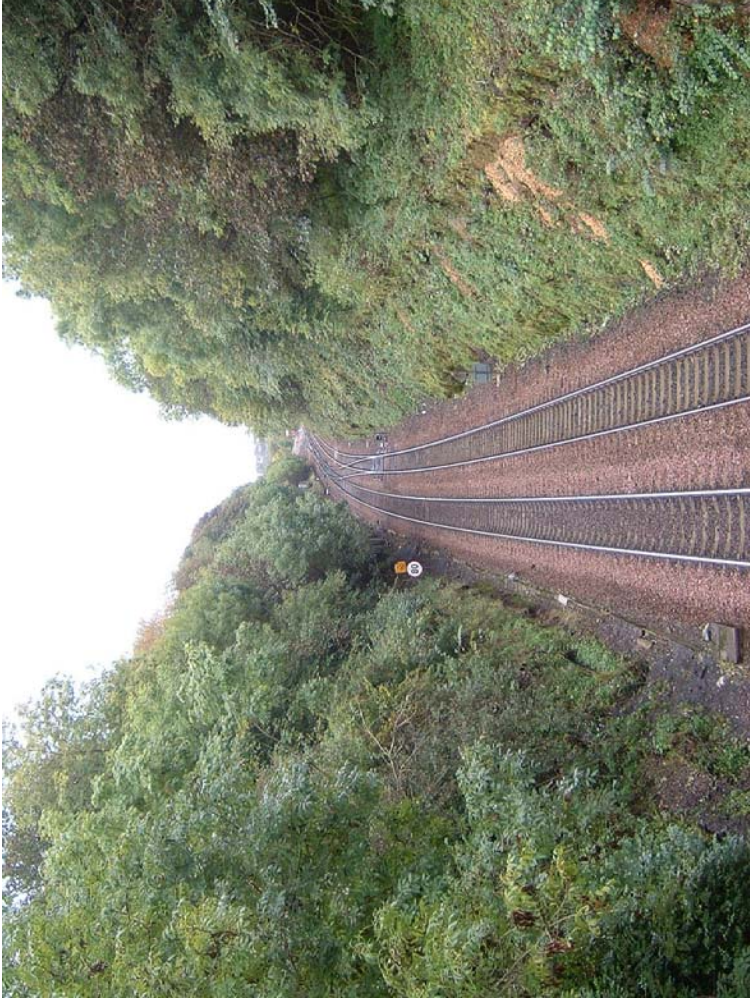
Existing view eastwards from pedestrian bridge (to the west of the junction) along rail line